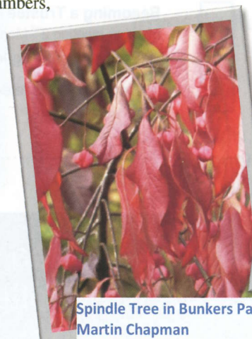
Spindle Tree in Bunkers Park: Martin Chapman